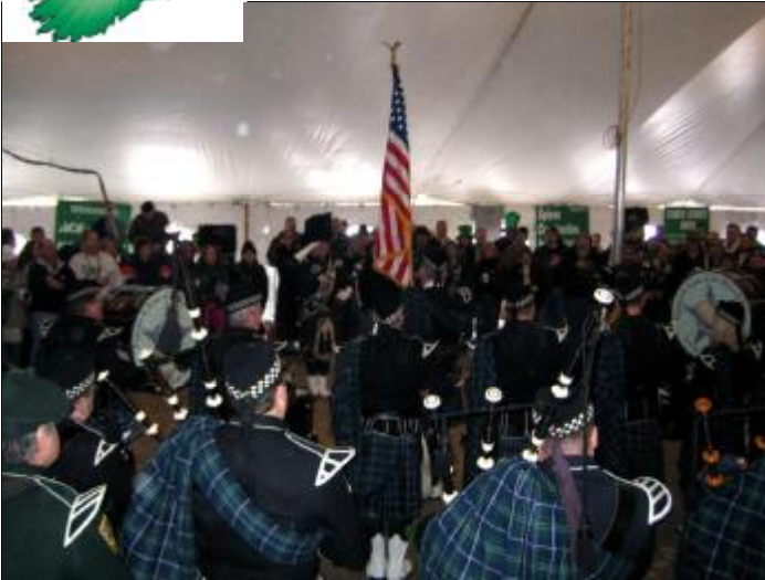
The Pipes and Drums of the Emerald Society performed in the Entertainment tent for Manhattan Irish Fest XIII