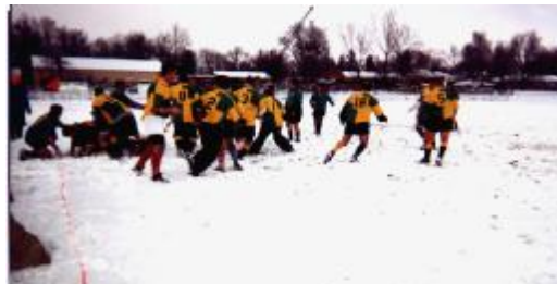
Our Shamrock Rugby Club plays in any weather